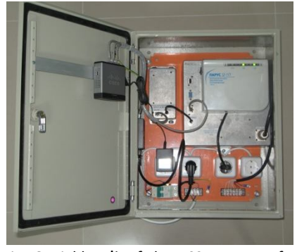
Fig. 6. Field unit of the NSSM system for land installation