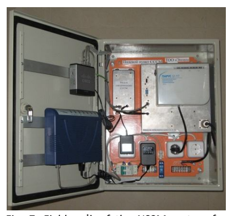
Fig. 7. Field unit of the NSSM system for underground installation