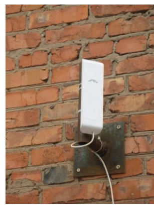
Fig. 9. The client station of a communication network NSSM for average distances