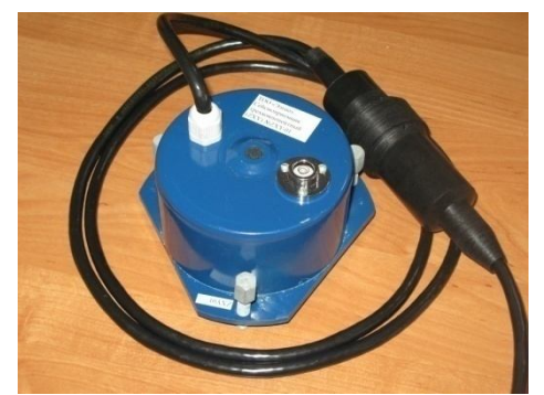
Fig. 4. NSSM geophone for the surface installa- Fig. 5. A geophone for well installation tion

The design of field unit of the NSSM system allows placing it both on a surface, and in underground excavations, explosion-proof on gas and dust. Geophones for the NSSM system are shown in fig. 4 and fig. 5. The design of seismicfield unit for land installation is shown in fig. 6. The design of seismic field unit for underground installation is shown in fig. 7. Any modern means of communication compatible to technologies of computer networks can be used to communication of field units with the center of collecting and processing. Wireless computer networks are convenient for the field units established on the Earth's surface. In fig. 8. the access point of the center of a wireless communication network is shown. Client stations of wireless network for communication with the center of collecting and processing are shown in fig. 9. and fig. 10. For communication with the field units established underground in mines, the dedicated wire lines, optical lines have to be applied. At development of the system of NSSM the problem of synchronization of all field units of system including established in underground excavations from GLONASS/GPS of the receiver installed on the land surface is solved.